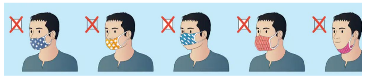
Fig. 2: Incorrect masking techniques